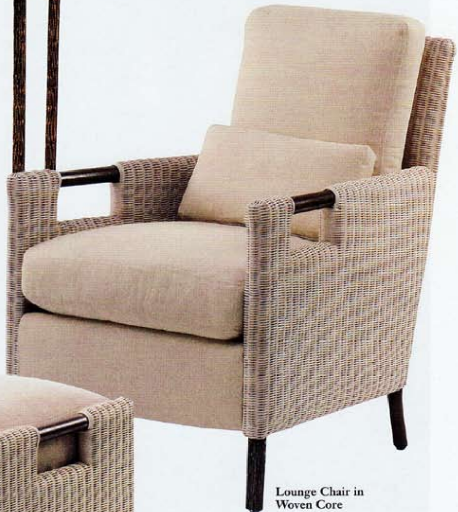
Lounge Chair in Woven Core