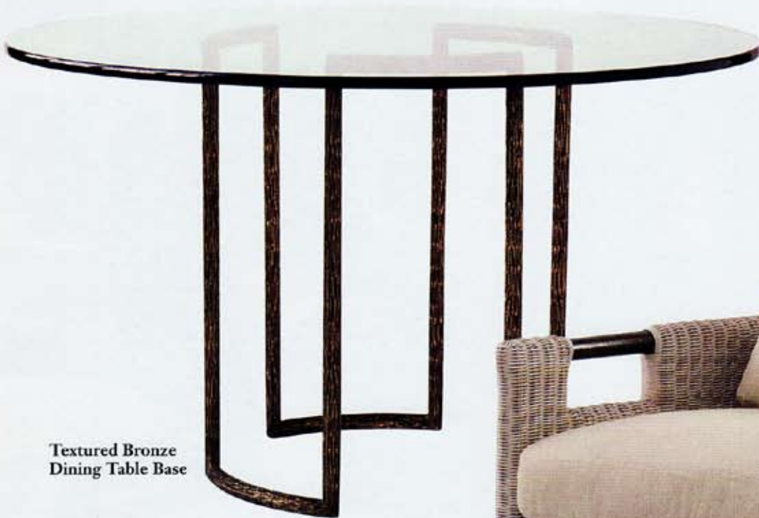
Textured Bronze Dining Table Base