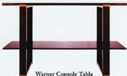
Warner Console Table