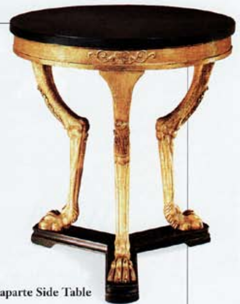
Bonaparte Side Table