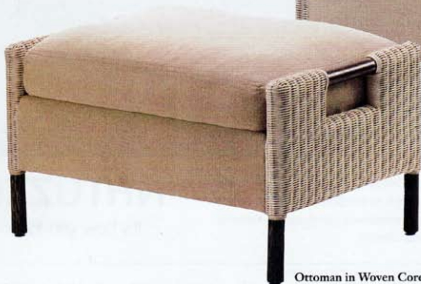
Ottoman in Woven Core

Pheasant decided to "resolve the practical issues of size and functionality."