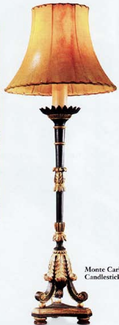
Monte Carlo Candlestick Lamp