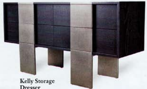
Kelly Storage Dresser