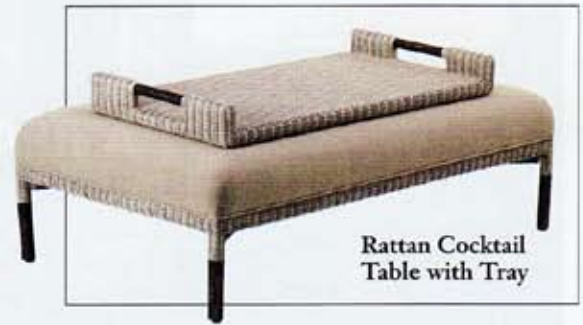
Rattan Cocktail Table with Tray

work that he elegantly mixed with rattan, rattan core, leather, glass and limestone. A versatile cocktail table that comes accessorized with a removable tray illustrates his overall decision to "resolve the practical issues of size and functionality." All the pieces have refined shapes, an element synonymous with Pheasant's designs, and share a distinct contemporary sensibility.