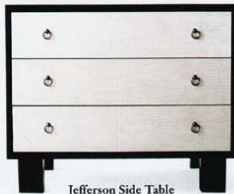
Jefferson Side Table